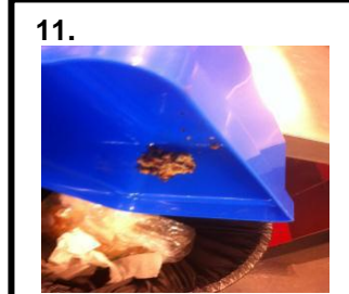
Empty contents of catchment draw into rubbish bin

Slide catchment draw out, located on the RHS of Grease Shield unit