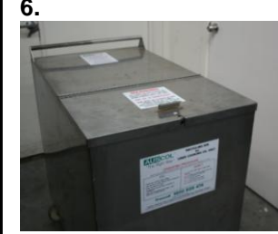
Transfer dirty canister to waste oil recycling tank/44 gallon drums located at Back of House